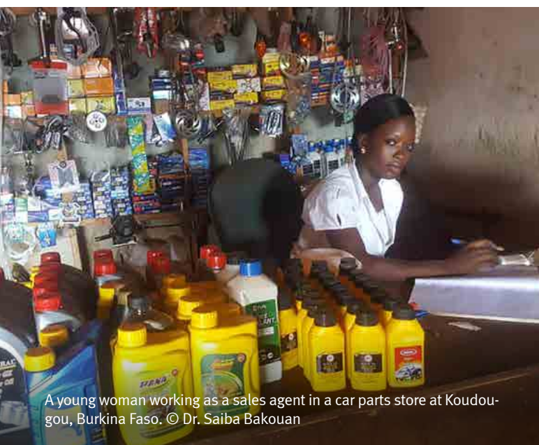
A young woman working as a sales agent in a car parts store at Koudougou, Burkina Faso.

The team has already found that career and school counsellors could act as catalysts in the effort to cut down unemployment and promote decent work. It also probed the definition of ‘decent work’ – since 2015 an explicit goal in the UN’s 2030 Agenda for Sustainable Development – to pinpoint what it means to people in Sub-Saharan countries